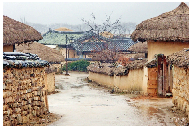
Suwon Korean Folk Village / Andong Hahoe Folk Village

Day 6 SOKCHO (EAST COAST). Morning is Free & Easy, then we check-out and re-group before noon to bus 2.5 hours to Sokcho, which is a coastal town by the East Sea (or Sea of Japan). This pleasant fishing town is well known for its raw-fish eateries. We take leisure walk to local market and rest early tonite. ON Sokcho.