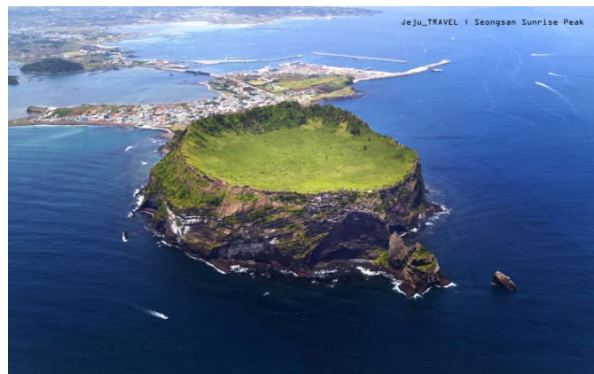
Jeju's Hallasan & Seongsan Ilchubong