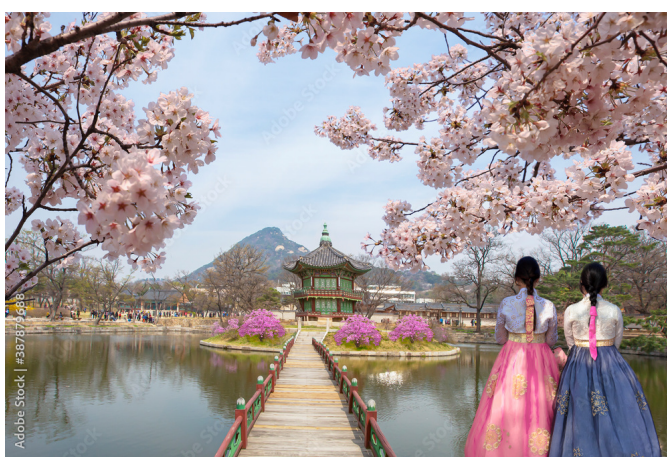
Gyeongbokgung Changing Guards & in Spring

Day 1 KLIA2. Meet KLIA2 by 8 PM for AA flight to Seoul departing 11 PM on 2 APR 2023 SUNDAY..